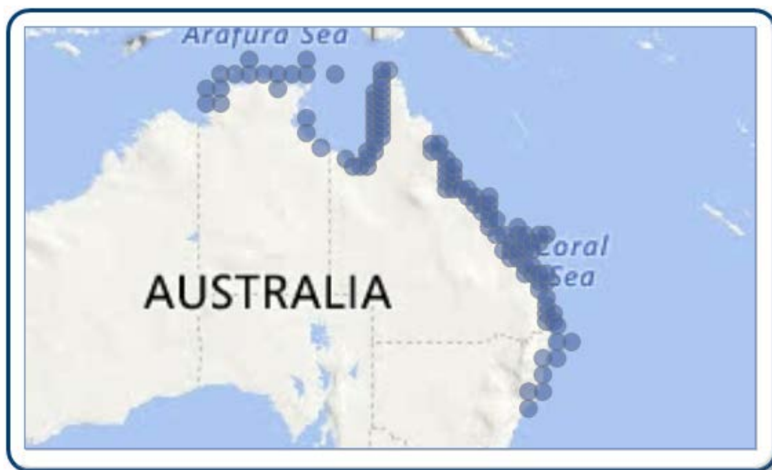
Distribution of reported commercial catch of Blacktip Sharks