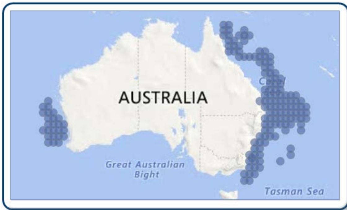
Distribution of reported commercial catch of Albacore