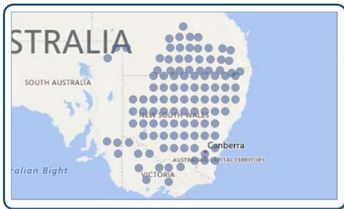
Distribution of Murray Cod based on reported catch