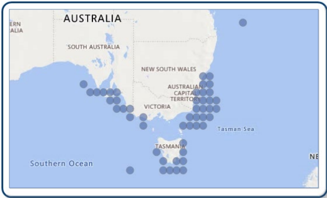
Distribution of reported commercial catch of Southern Bluefin Tuna