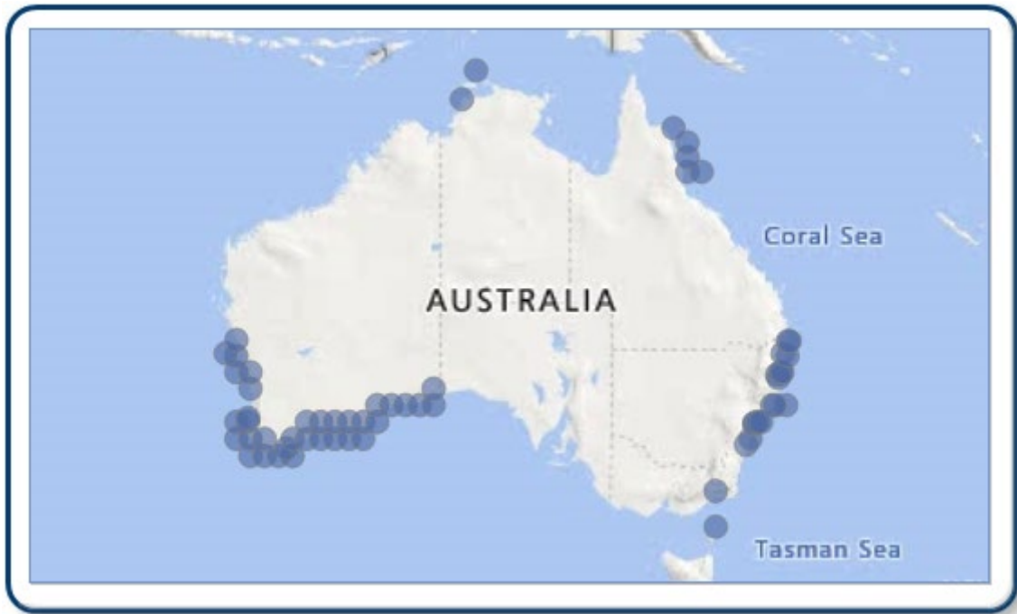
Distribution of reported commercial catch of Dusky Shark