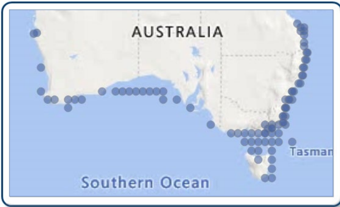
Distribution of reported commercial catch of John Dory