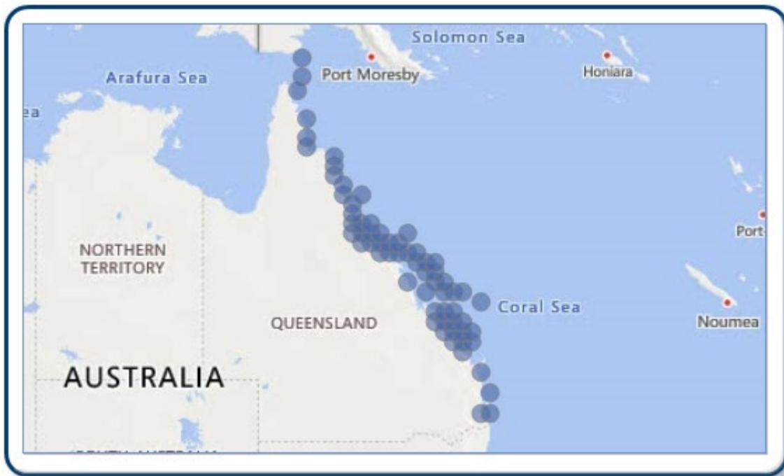
Distribution of reported Commercial Catch of Redspot King Prawn.