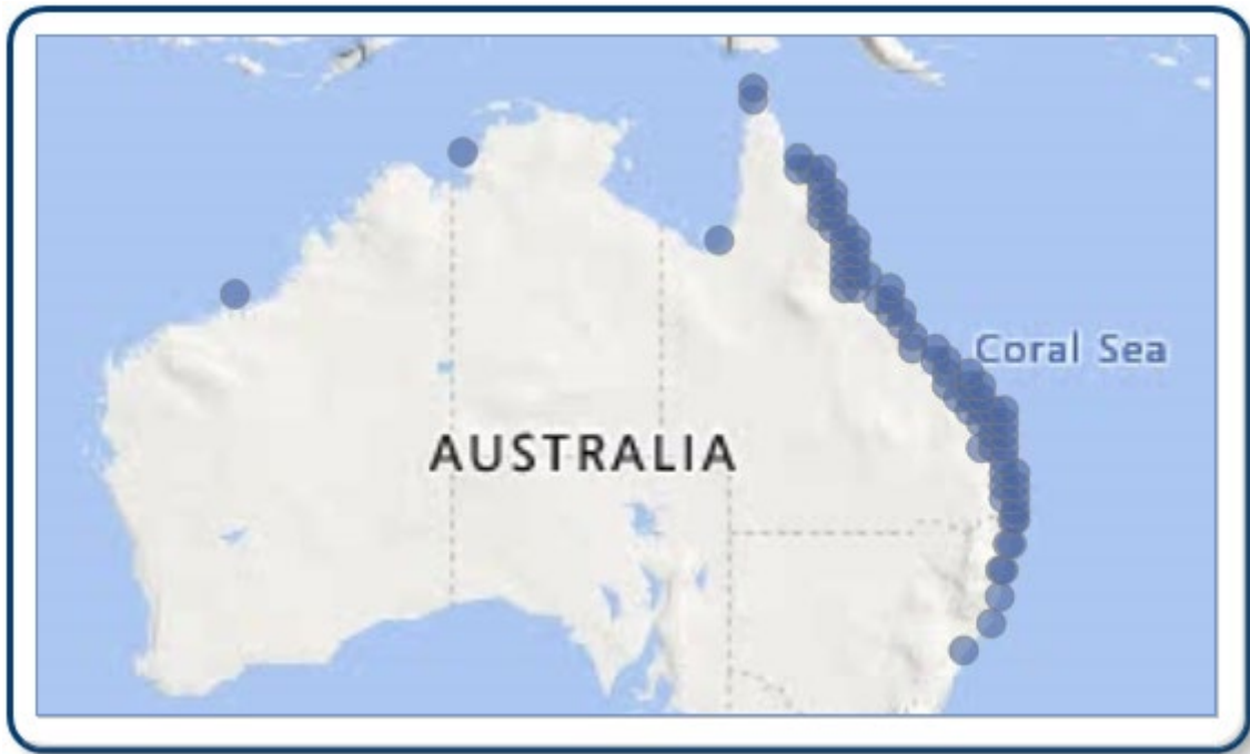
Distribution of reported commercial catch of School Mackerel