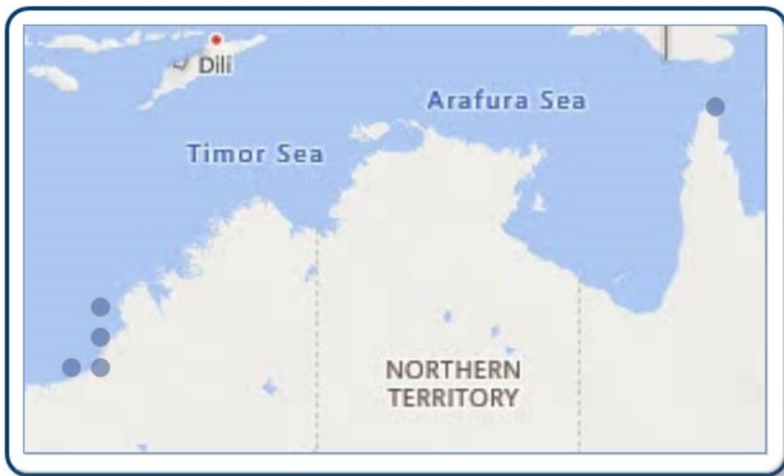
Distribution of reported commercial catch of Silverlip Pearl Oyster